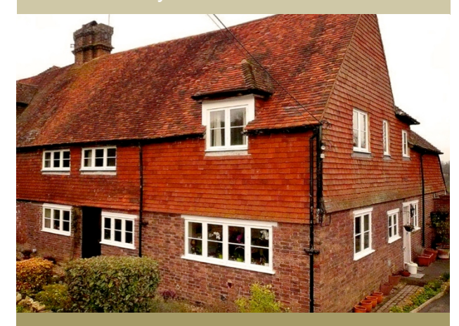
Hamsell Cottage, Grade II listed.

The owner wanted to improve the appearance and energy-efficiency of this 16th century medieval hall house without compromising its character. Many specific requirements demanded by the Conservation Officer had to be satisfied before conservation and planning permissions were granted.