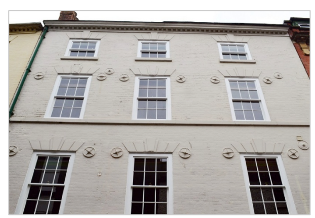
Grade II mid 18<sup>th</sup> century. New box sash, single-glazed replacement windows with 19mm fine glazing bars with lamb's tongue internal profiles.

Note : Whilst every effort has been made to ensure the accuracy of advice given, neither the Wood Window Alliance nor the British Woodworking Federation can accept liability for loss or damage arising from the use of the information supplied in this publication.