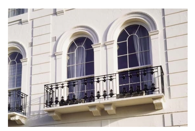
Grade II (1845). New round headed, box sash, double-glazed replacement windows with 17mm fine glazing bars with lamb's tongue internal profiles.