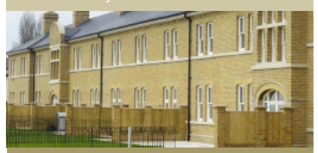
Grade II Heritage conversion of MoD Officers' Mess at the Shoebury Garrison.

Having housed Royal Artillery and Gunnery schools since the early 1800's, Shoebury Garrison is now recognised as an area of national importance and is protected, much of it as a conservation area.